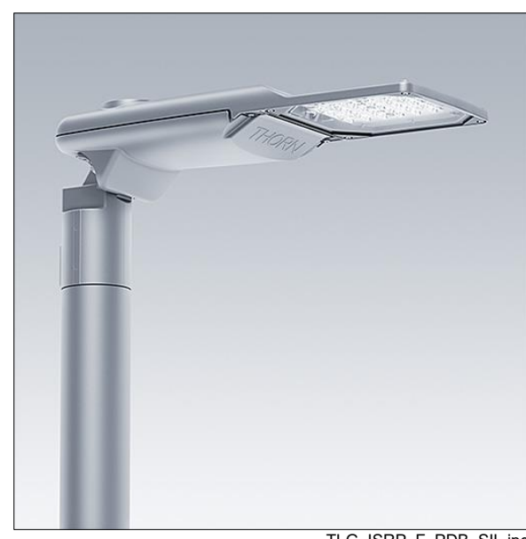
TLG ISRP F PDB SIL.jpg

Weight: 5.19 kg Scx: 0.054 m<sup>2</sup>