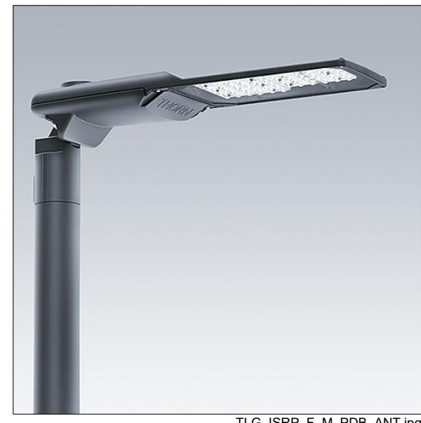
TLG ISRP F M PDB ANT.jpg