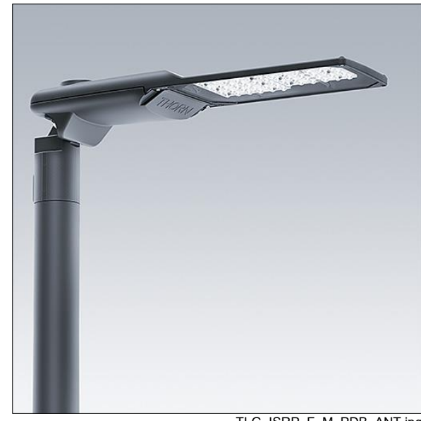
TLG ISRP F M PDB ANT.jpg