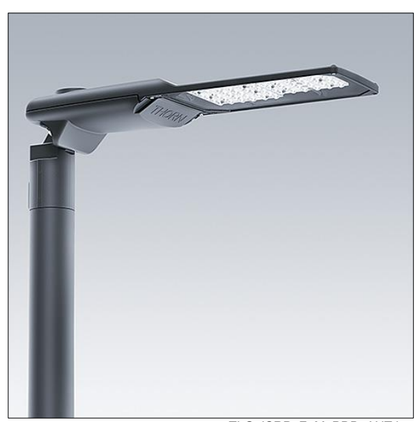
TLG ISRP F M PDB ANT.jpg

This product contains a light source of energy efficiency class E.