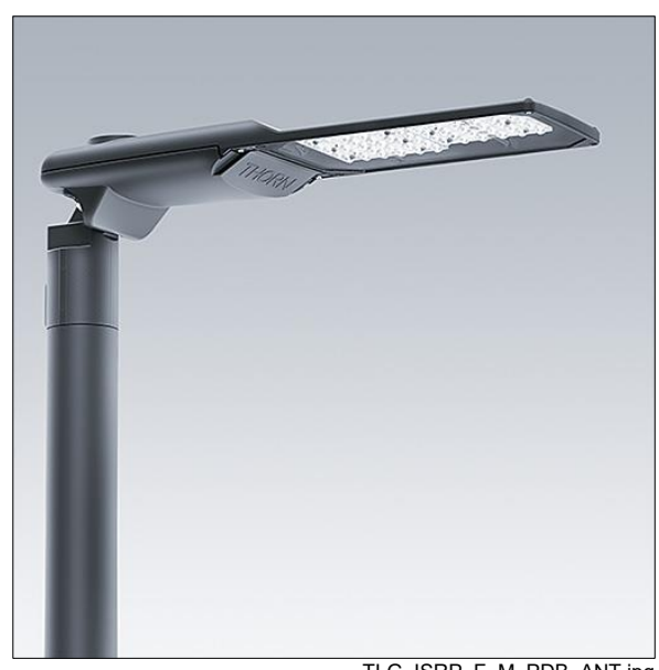
TLG ISRP F M PDB ANT.jpg