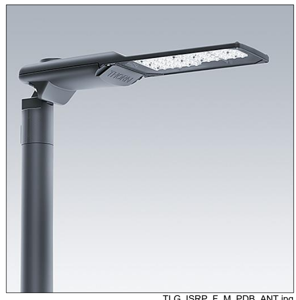
TLG ISRP F M PDB ANT.jpg