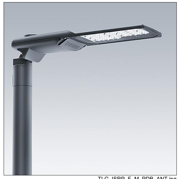
TLG ISRP F M PDB ANT.jpg