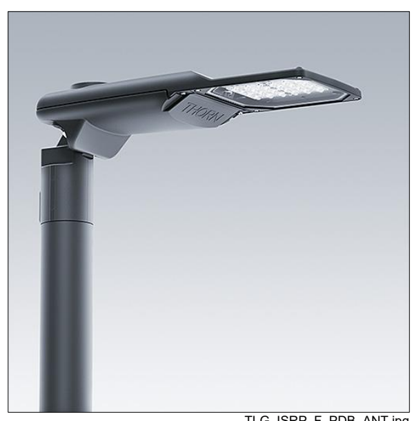
TLG ISRP F PDB ANT.jpg