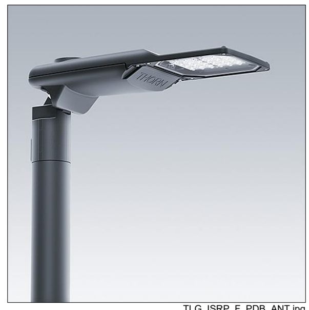
TLG ISRP F PDB ANT.jpg