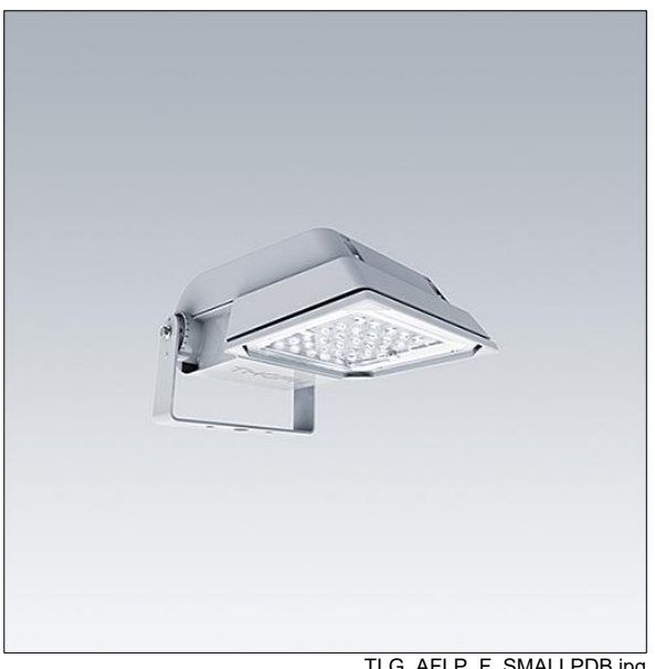
TLG AFLP F SMALLPDB.jpg