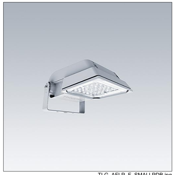
TLG AFLP F SMALLPDB.jpg