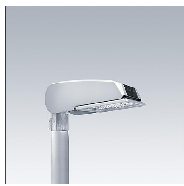
TLG CTEQ F SMTP36LEDPDB.jpg