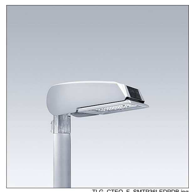
TLG CTEQ F SMTP36LEDPDB.jpg