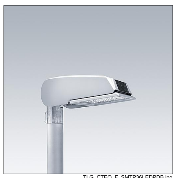
TLG CTEQ F SMTP36LEDPDB.jpg