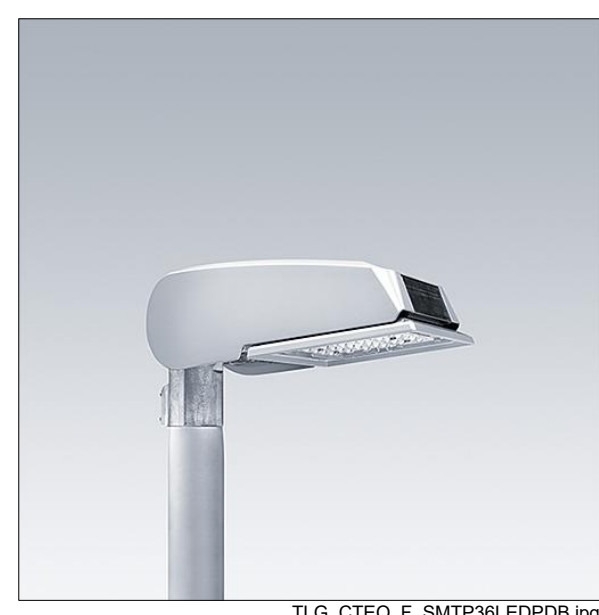
TLG CTEQ F SMTP36LEDPDB.jpg