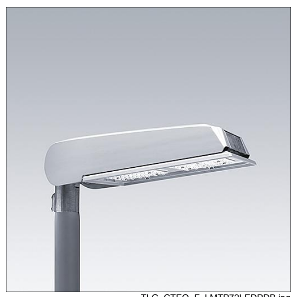
TLG CTEQ F LMTP72LEDPDB.jpg