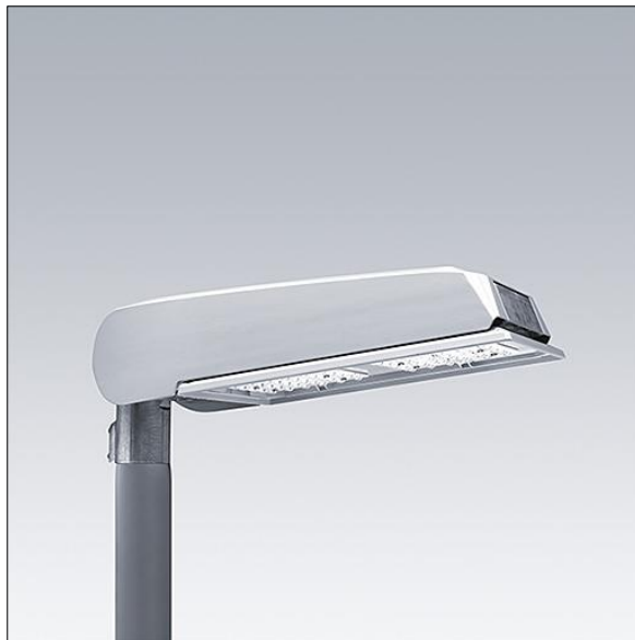
TLG CTEQ F LMTP72LEDPDB.jpg

Dimensions: 580 x 230 x 160 mm Luminaire input power: 62 W Luminaire luminous flux: 10608 lm Luminaire efficacy: 171 lm/W Weight: 9.6 kg Scx: 0.115 m 2