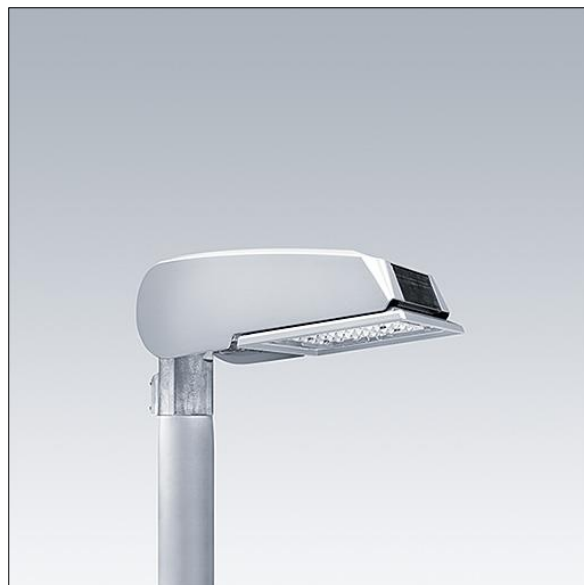
TLG CTEQ F SMTP36LEDPDB.jpg

Dimensions: 390 x 230 x 133 mm Luminaire input power: 20 W Luminaire luminous flux: 2948 lm Luminaire efficacy: 147 lm/W Weight: 5.7 kg Scx: 0.077 m 2