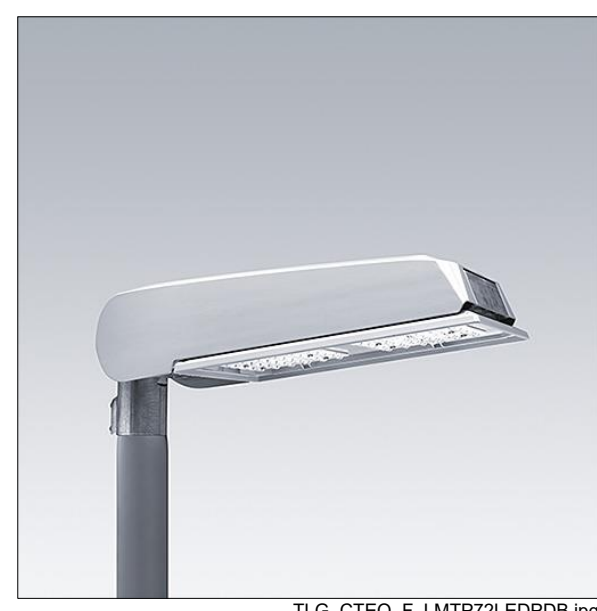
TLG CTEQ F LMTP72LEDPDB.jpg