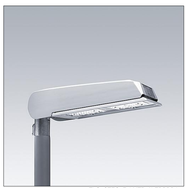
TLG CTEQ F LMTP72LEDPDB.jpg