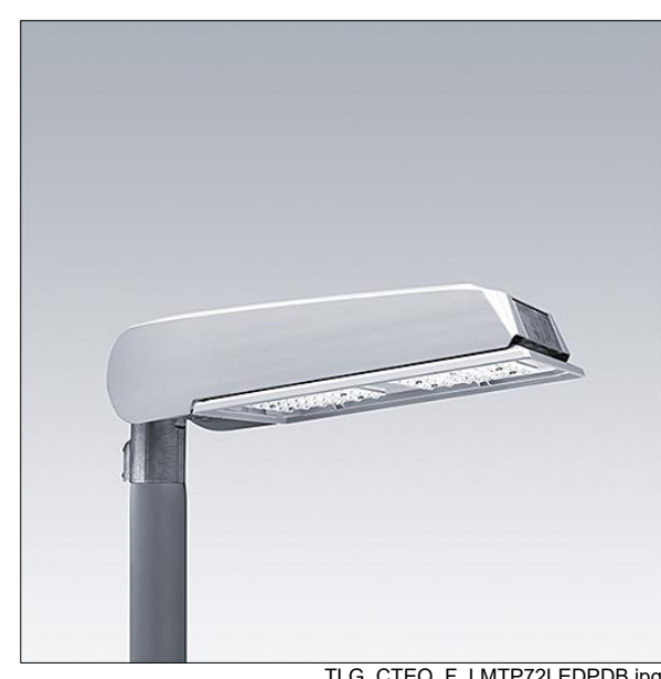
TLG CTEQ F LMTP72LEDPDB.jpg