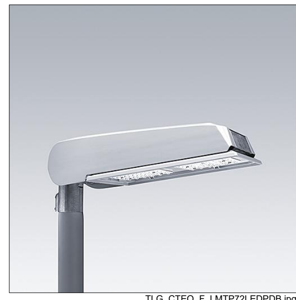
TLG CTEQ F LMTP72LEDPDB.jpg