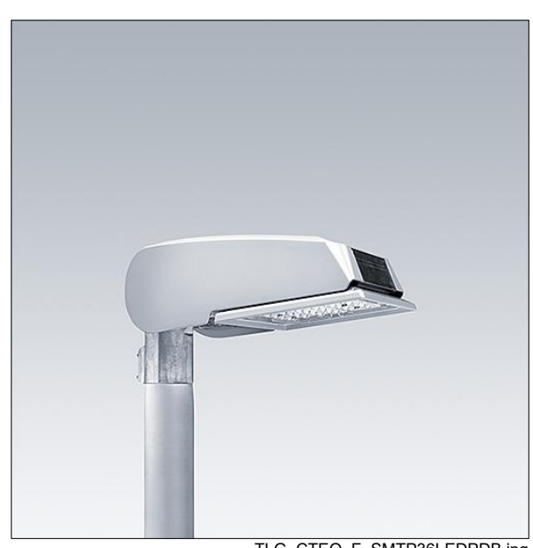
TLG CTEQ F SMTP36LEDPDB.jpg