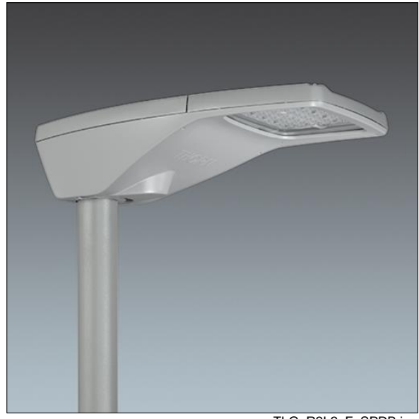
TLG R2L2 F SPDB.jpg