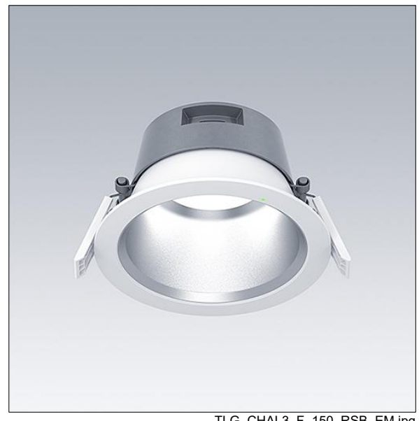
TLG CHAL3 F 150 RSB EM.jpg