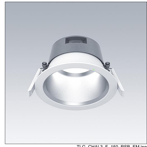
TLG CHAL3 F 150 RSB EM.jpg