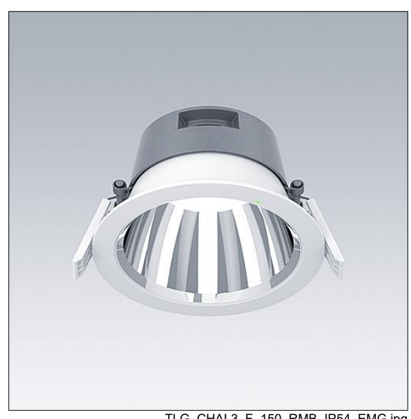
TLG CHAL3 F 150 RMB IP54 EMG.jpg