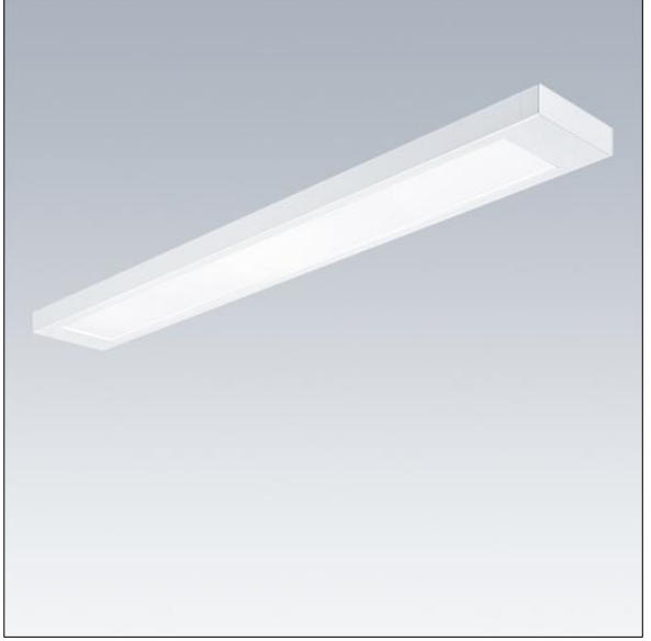
TLG PNCH F LRO surface on PDB.jpg