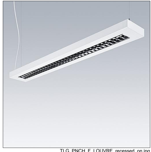
TLG PNCH F LOUVRE recessed on jpg