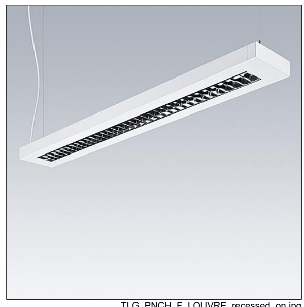
TLG PNCH F LOUVRE recessed on jpg