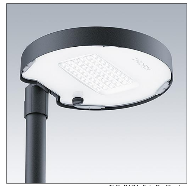
TLG CARA F L PostTop.jpg