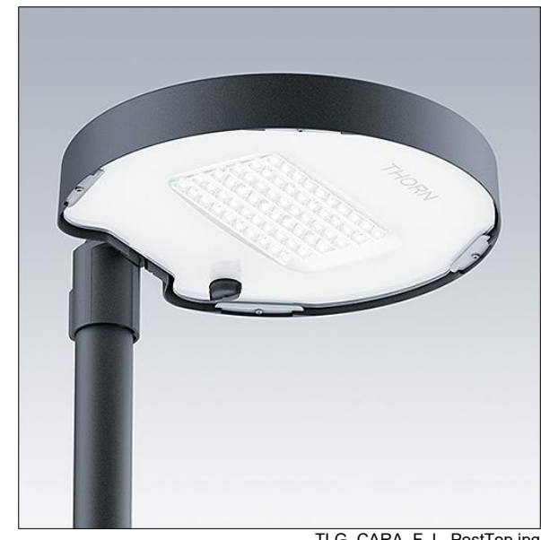
TLG CARA F L PostTop.jpg