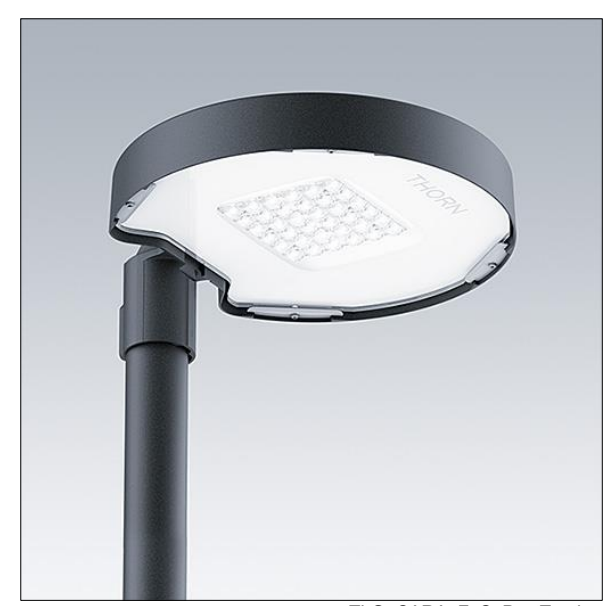
TLG CARA F S PostTop.jpg