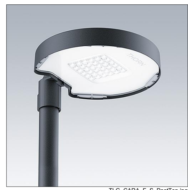
TLG CARA F S PostTop.jpg