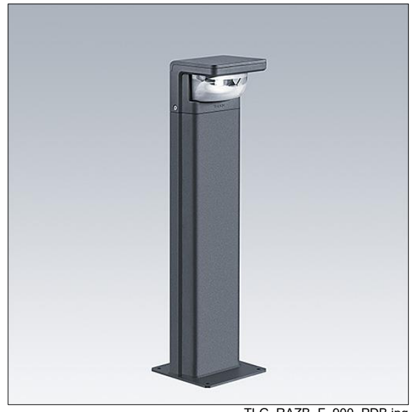
TLG RAZB F 900 PDB.jpg