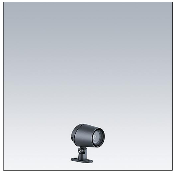
TLG CON3 F XS.jpg

Dimensions: Ø83 x 103 mm Luminaire input power: 8 W Luminaire luminous flux: 409 lm Luminaire efficacy: 51 lm/W Weight: 0.92 kg