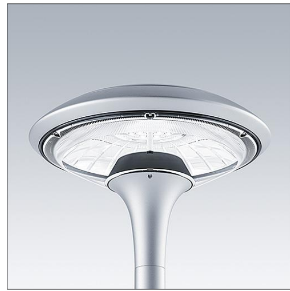
TLG PLRL F DDC GY.jpg