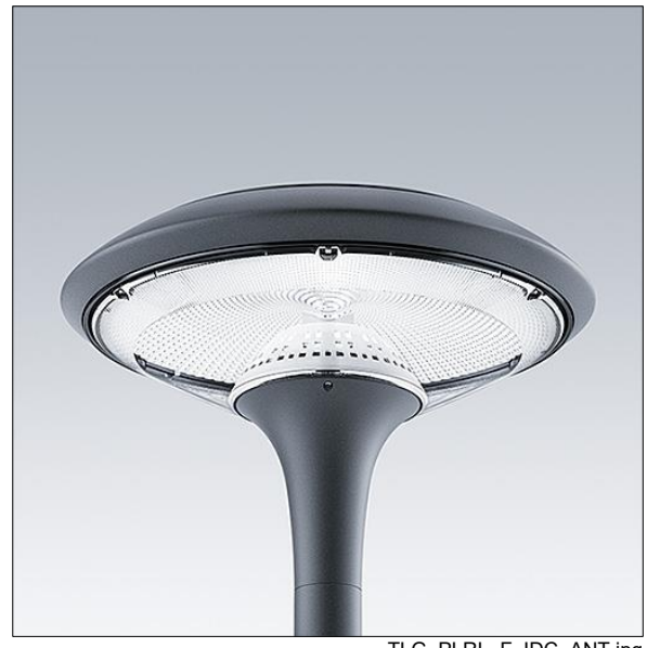
TLG PLRL F IDC ANT.jpg