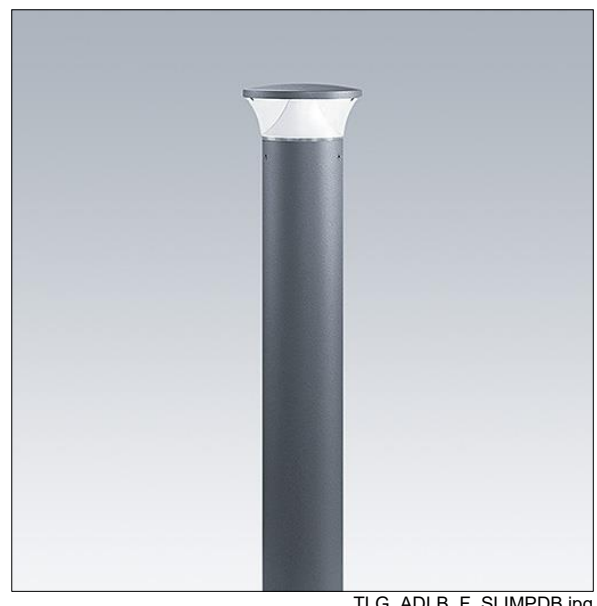
TLG ADLB F SLIMPDB.jpg