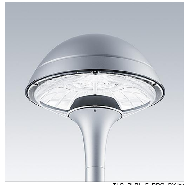
TLG PLRL F DRC GY.jpg